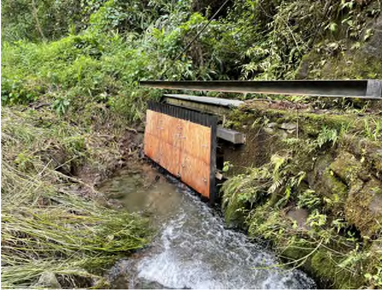
Diversion 770 Intake

Appendix 9. Photo of source and diversion.