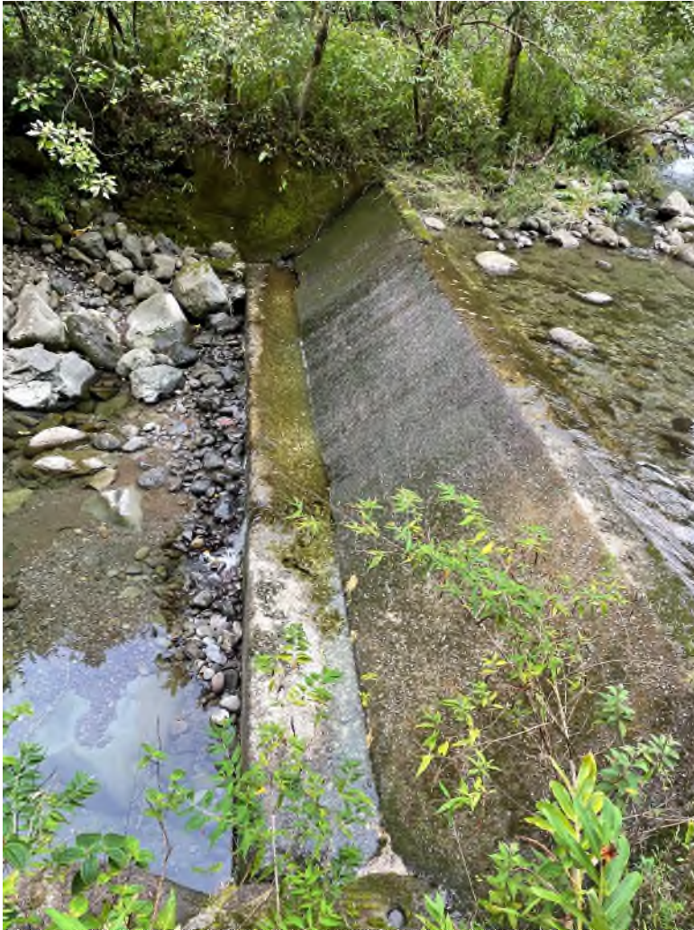
Diversion 770 wetted dam